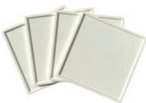
Polystyrene wall panel