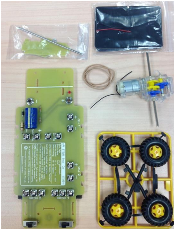
STELR Solar Car kit ready for assembly