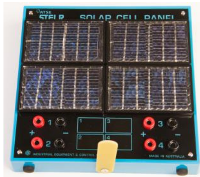
Solar cell panel