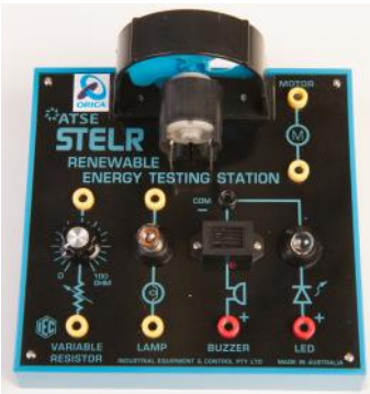
Test rig module