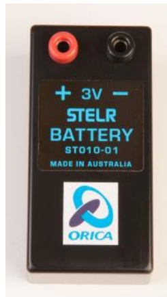
3V battery pack