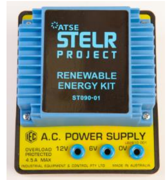
12V power supply