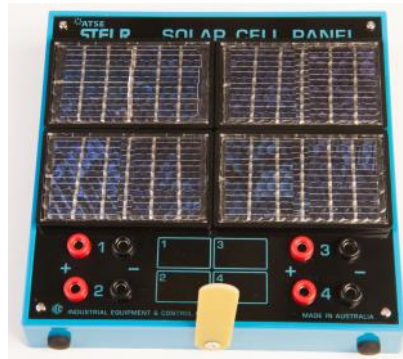
Solar cell panel