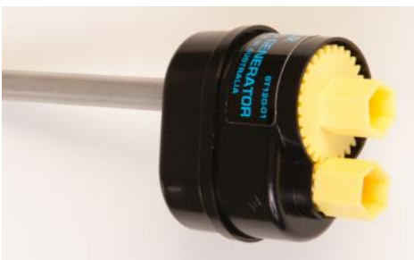
Wind turbine generator