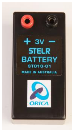
3V battery pack