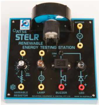
Test rig module