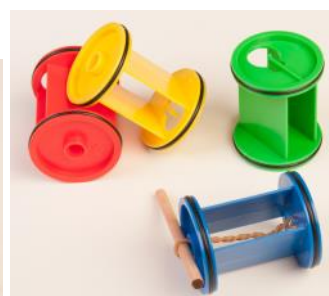
Cotton reel racer