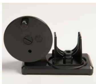
Hand-crank generator base