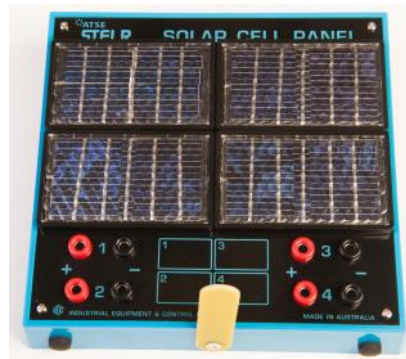
Solar cell panel