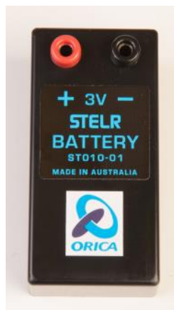
3V battery pack